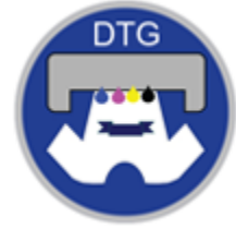
DIGITAL TEXTILE PRINTING (DTG)